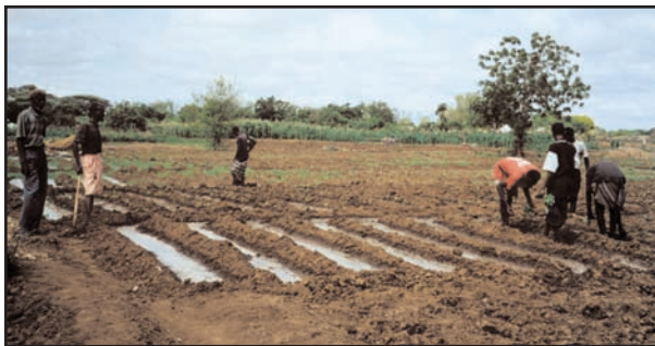
Feeding oneself gives dignity and pride.

FRB member organizations use FRB resources to provide food, but their major focus is to supply the knowledge and materials people need to start feeding themselves.